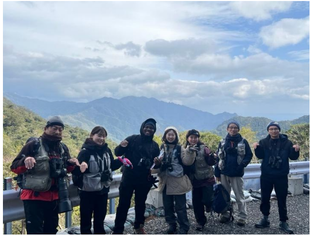
Fig.4 Group Photo at an elevated point