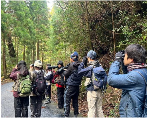
Fig.3 Participants observing a bird.