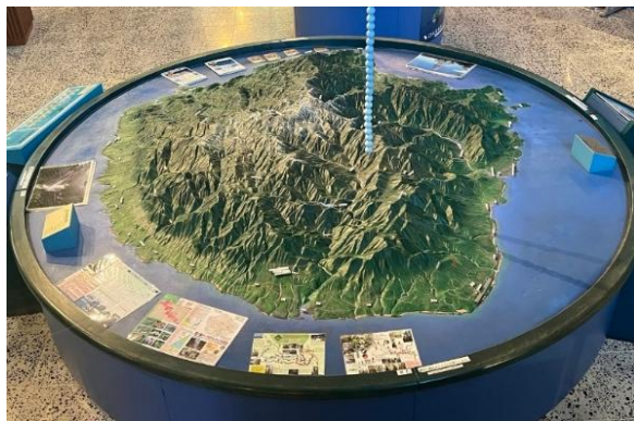
Fig.1 Model of the Yakushima Island

Upon arrival at Yakushima Island, we had a briefing with Sugiura-sensei and Suzumura-San who provided many details about the island, the purpose of trip and some safety tips for both the field and the residency-PWS House in Nagata Town. Participants were also treated to a trip to the Yakushima Museum to observe and learn interesting facts and places on the island.