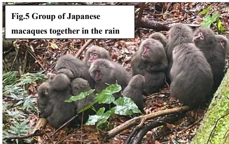
Fig.5 Group of Japanese macaques together in the rain

The activity budget also included monkey and deer observation. As part of this activity, participants walked at various locations and often stopped during car rides to observe at a recommended distance any group of monkeys they came across. A fascinating observation that was made was how the Japanese Macaques huddled together during the rainy periods to protect their young and keep each other warm.