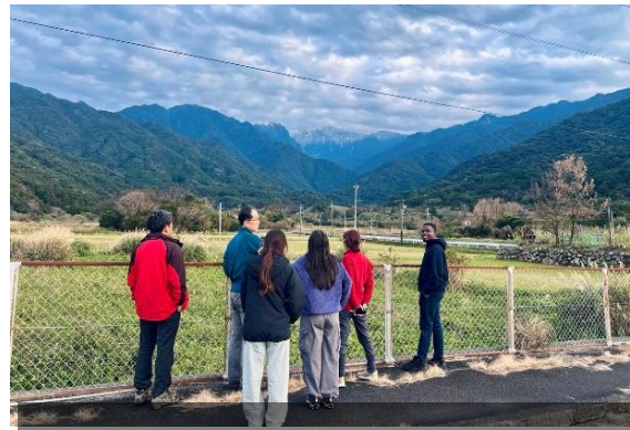
Figure 2: Participants enjoying the beautiful Scenery.