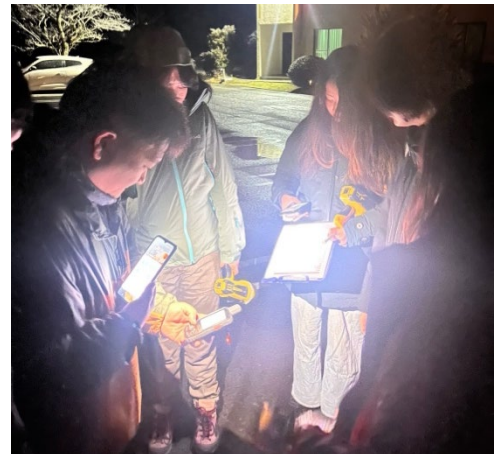
Light Census Survey Preparation

We ended the day with lunch, where a local restaurant “Kaariman” prepared taco rice, black bean stew, and sausage made from boar or deer meat. While serving us, the owner explained how they began using wild game meat in their cooking and shared how he wants to promote Tamba-Sasayama so that both people and wildlife can live together in harmony. While having lunch, we continued talking with the locals, and they shared their concerns about the aging and shrinking population, which has made it difficult for the community to muster the energy and labor needed to continue implementing animal damage prevention measures.