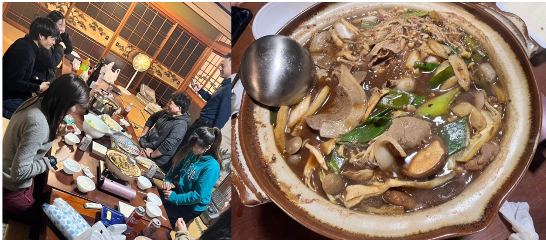
Dinner: Black Bean Boar Stew

After conducting GPS and behaviour surveys throughout the afternoon, we prepared for dinner, boar stew (ぼたん鍋) before carrying out a light census survey at night.