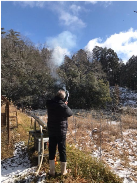
Locals driving away the macaques by setting off fireworks