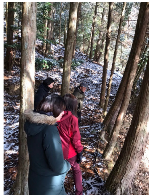
Checking the fences