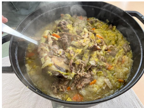
Delicious food prepared by “Kaariman”

From this field course, I was able to observe how Satomon, in cooperation with the government and relevant organizations, supports local communities that are working hard with limited resources to combat animal damage while promoting Tamba-Sasayama to bring in more generations. One of Satomon’s goal is to shift the perspective that wildlife damage is purely a negative impact on the community. In reality, wild animals are an integral part of the satoyama landscape and one of the area’s attractions. Therefore, their aim is not only to reduce damage but also to maintain the presence of wildlife, promote positive coexistence measures by bringing the community together, and ultimately revitalize the area. Although I was only there for two days, I was impressed by Satomon’s efforts to mitigate such problems in rural areas of Japan and was glad to have had the chance to see it firsthand.